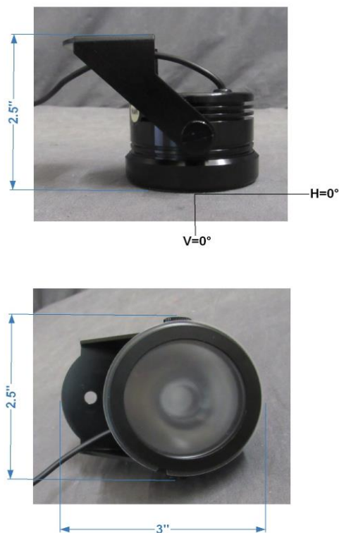
FIG. 1 LUMINAIRE